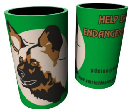
Can/Bottle Cooler (Stubby Holder)