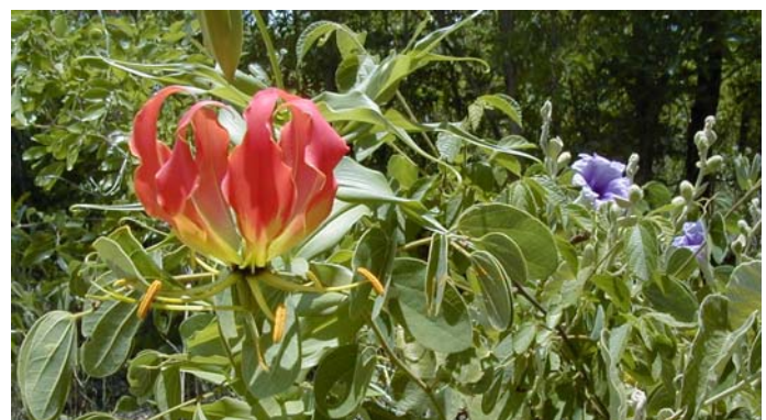
Flame Lily - Zimbabwe's national wildflower