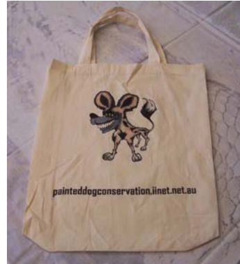
Reusable Calico shopping Bag

In line with our branding we have taken the opportunity to re-brand the T-shirts with our new logo.