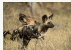
Lycaon pictus " African Painted Dog

And to all our members I would like to apologise for the lateness of this newsletter